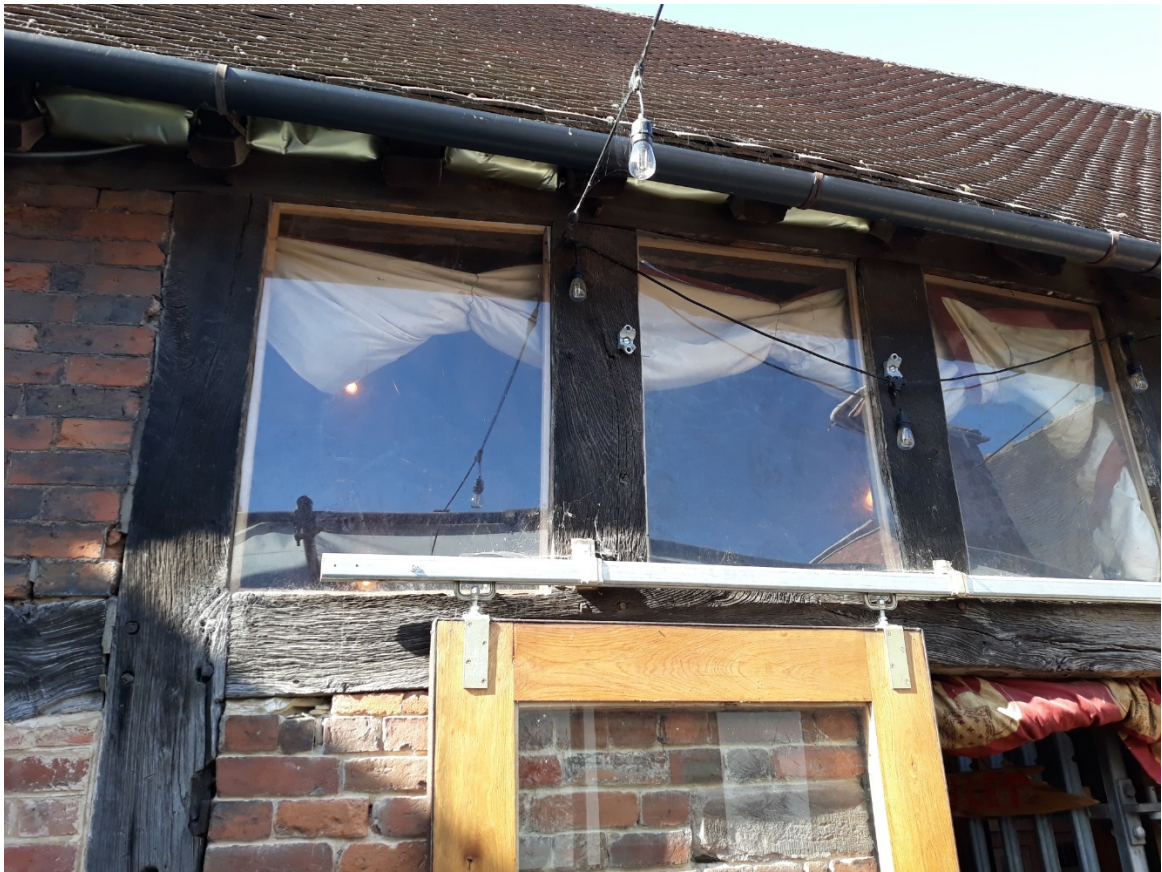
(Before railings went up)