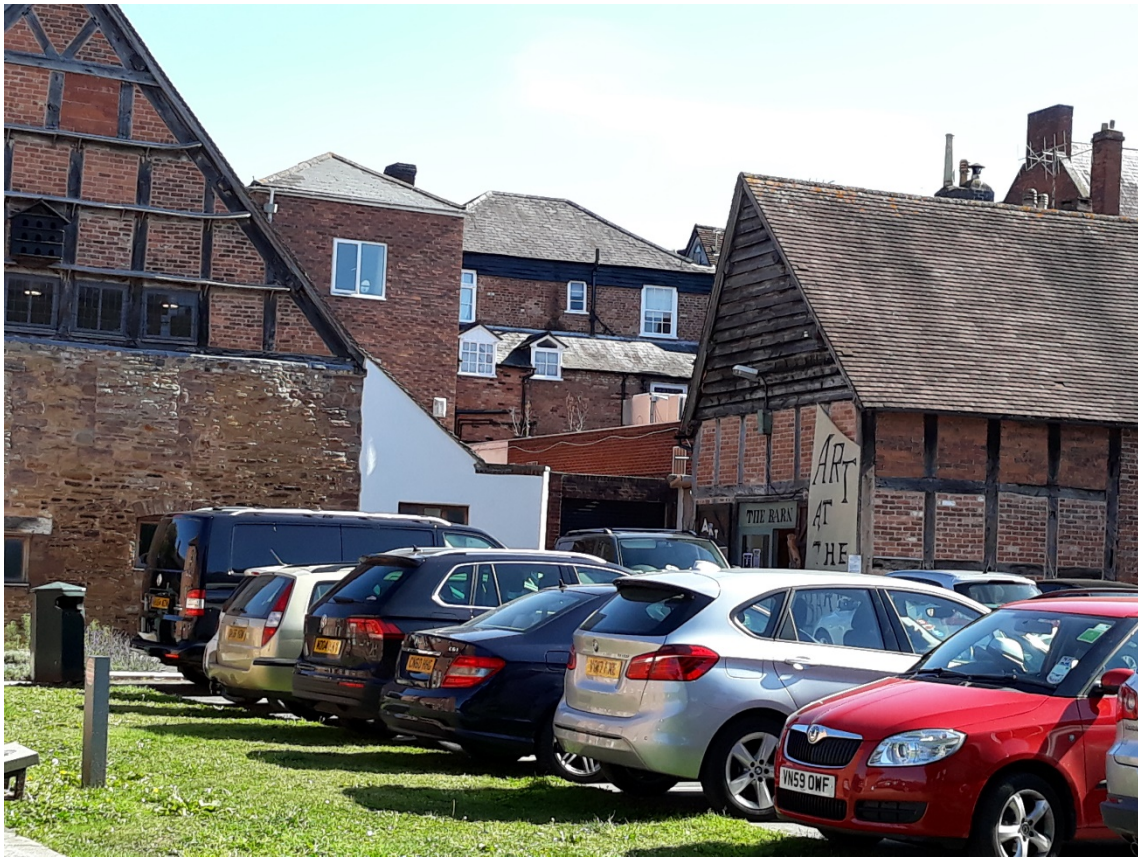
St Katherine's Barn – Located in St Katherine's Carpark Ledbury – behind Ledbury High Town