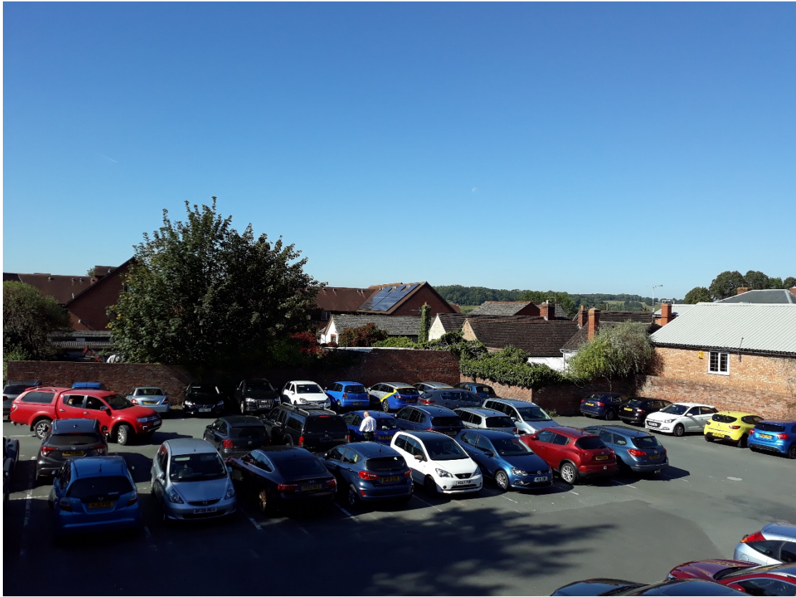
St Katherine's Carpark Entrance