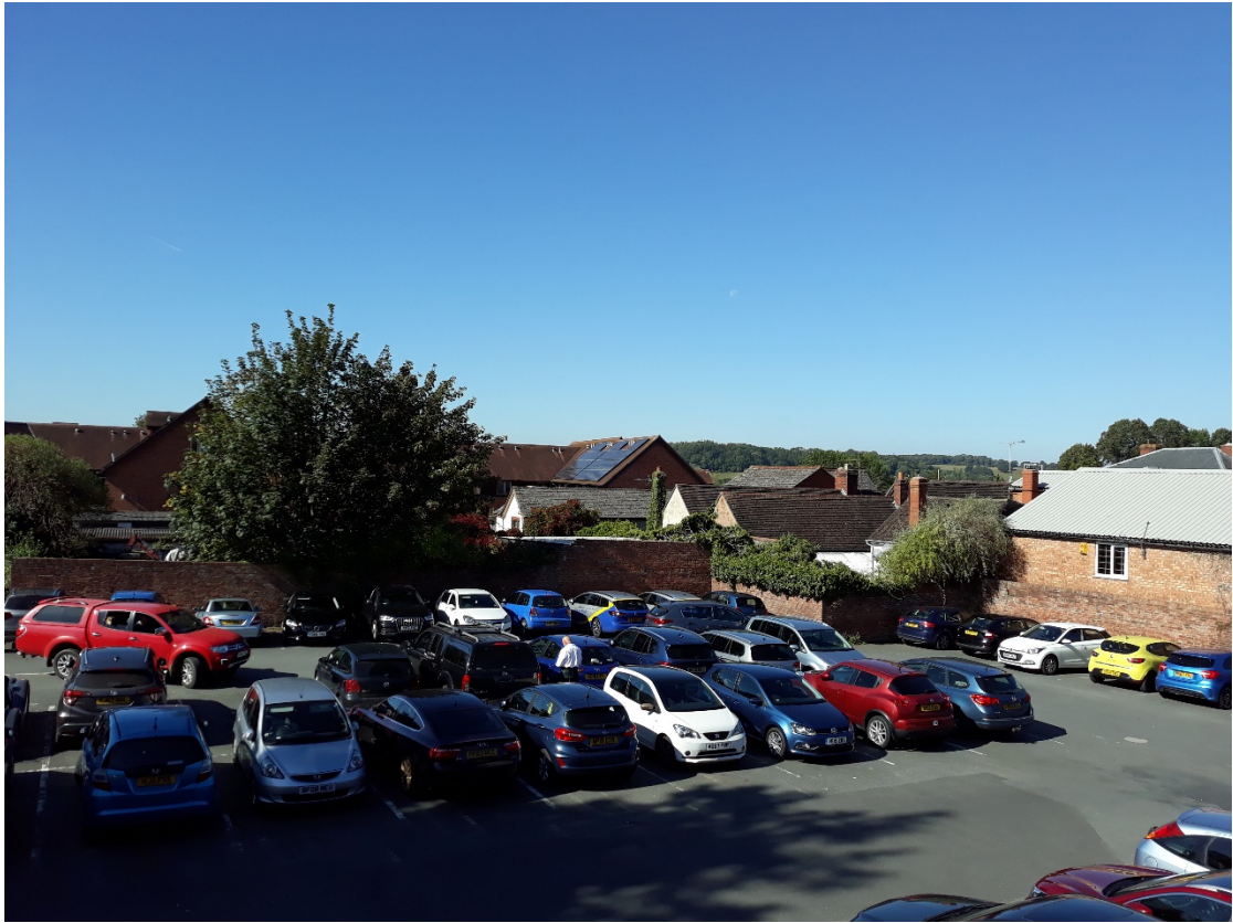
St Katherine's Carpark Entrance